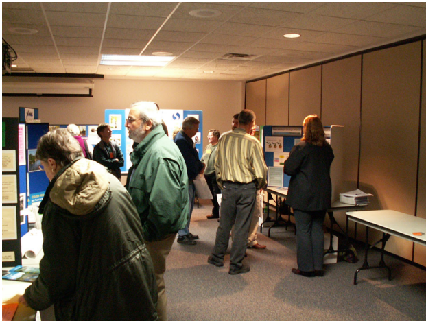
Eager learners at the Community Expo, part of the Watershed Short Course held in October, 2006