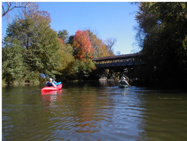
The Black River Watershed encompasses 287 square miles in Allegan and Van Buren Counties. The Black River flows into Lake Michigan at South Haven. Primary water quality concerns in the watershed are erosion and sedimentation, nutrient loading, and development issues.