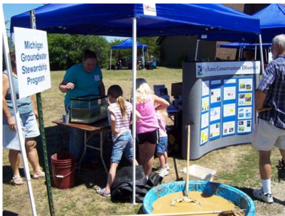
Right: Kids learn about stream habitat and macro-invertebrates during Fish Fest at the Wolf Lake Fish Hatchery.