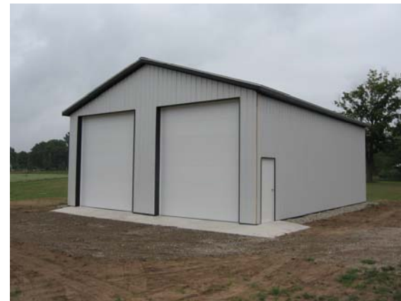
This photo shows an Agrichemical Containment Facility (ACF) that was completed in 2007 with cost share from NRCS, and design and construction site inspection services provided by the Van Buren Conservation District. Structures such as this are dedicated solely to storing and mixing agricultural chemicals (pesticides and

With a very successful 2007 EQIP signup, 2008 looks to be another year with a very high workload!