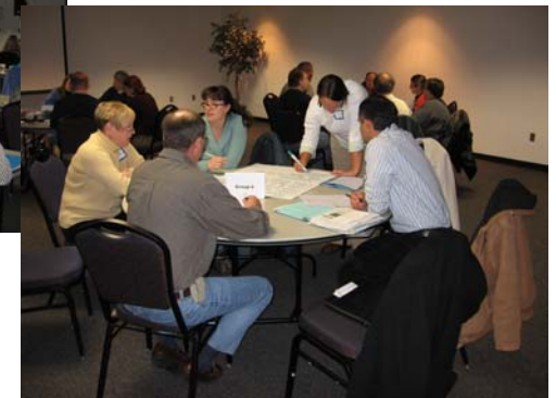
Low Impact Development seminar participants group up to discuss advantages and challenges of Low Impact Development