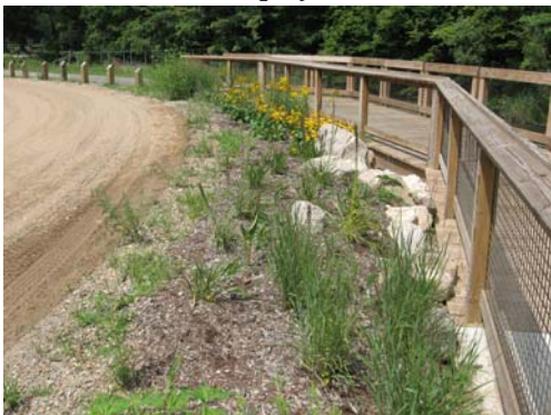
Native plants along the boardwalk installed in Bangor’s Lyons Park.