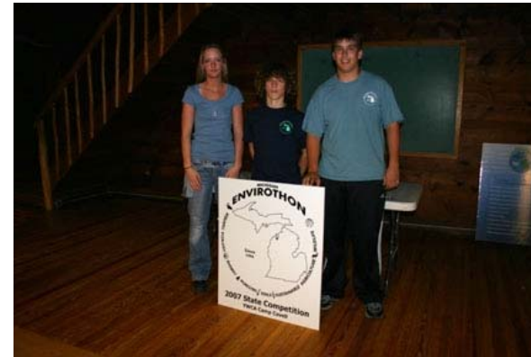
Van Buren Conservation District was a proud sponsor of the 2007 Lawton High School Envirothon team, who took First Place at the State competition, with only 3 team members!