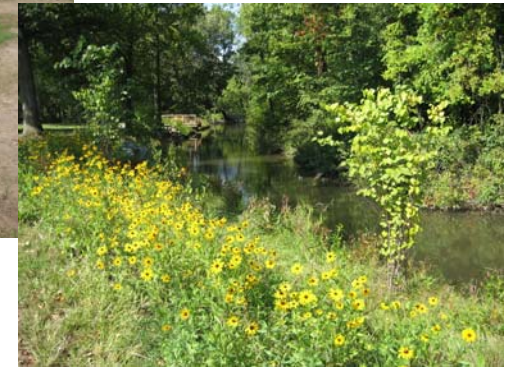
Raingarden and streambank restoration areas of the Lyons Park Project in Bangor.