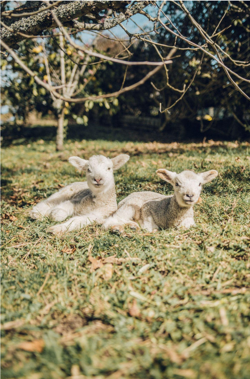
Spring Lambs at Thunderfoot Farm