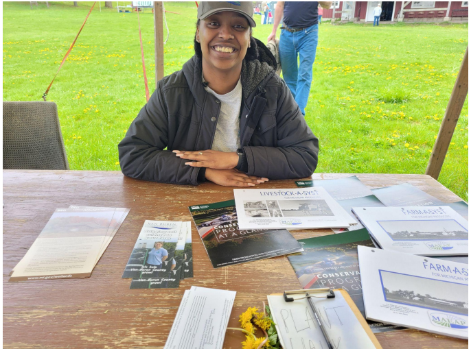
Kami representing the NRCS at Plow Day