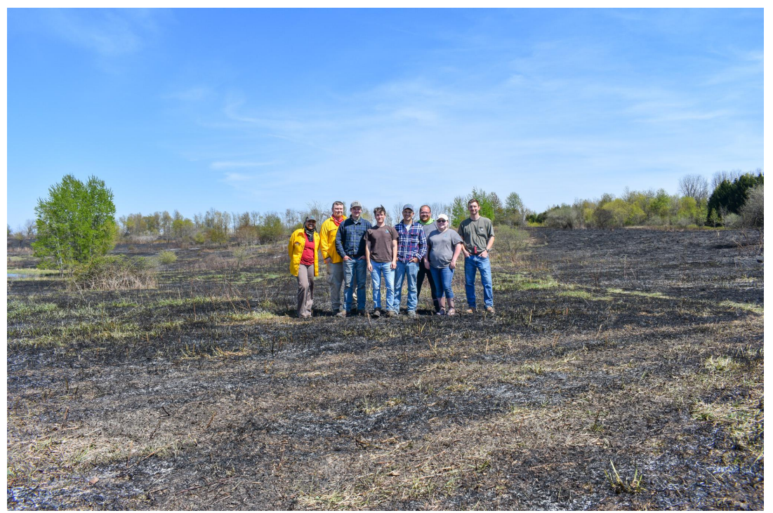
Staff and volunteers at Butterfield Drain examining the aftermath of the prescribed burn.