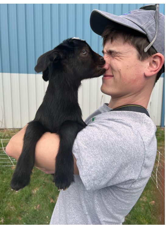
Baby Goats at Tree Sale