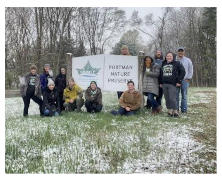
Photo Caption: VBCD Staff had a staff meeting at Portman Nature Preserve to celebrate Earth Week, the VBCD's 79th anniversary, and to participate in the Michigan Department of Natural Resources' 5K to Save the Trees.