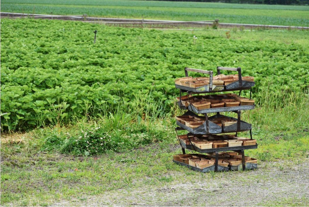
Strawberry season reached its peak in June with unusually warm temperatures.