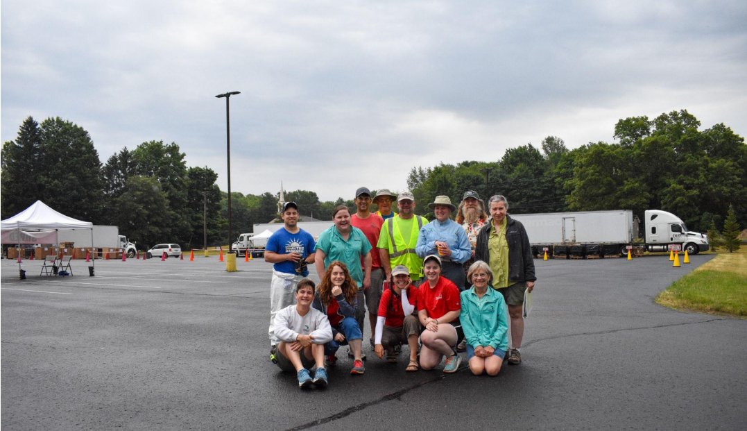
Group photo of staff and volunteers at the Paw Paw Recycle Roundup – the first Recycle Roundup of the year.