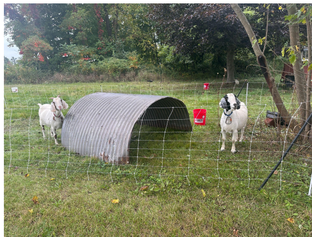
Goats during a farm visit in Paw Paw, Michigan